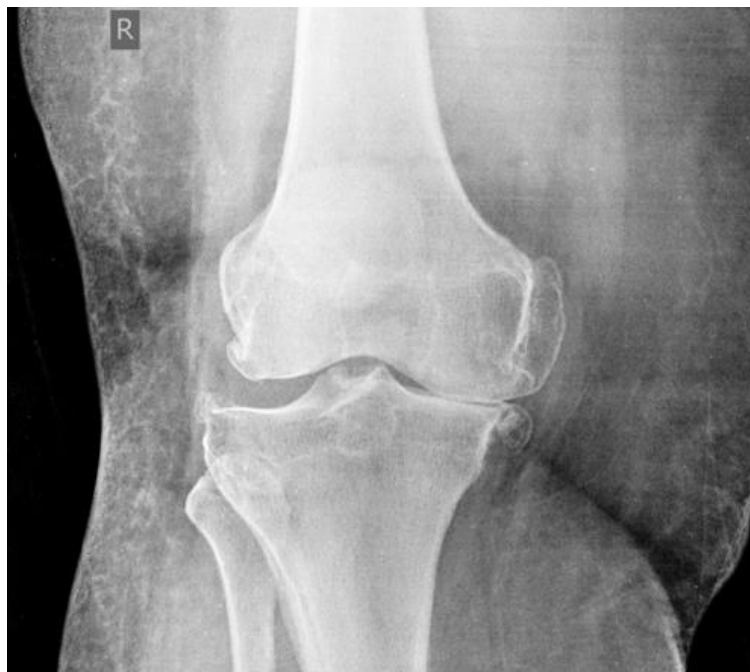
Figure 6. Right Knee Before Treatment

The following are the before and after X-rays of this patient. Both X-rays were evaluated in standing.