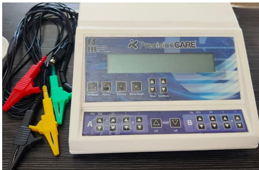
Figure 1. Precision Care FSM

Custom Care is a 2-channel, 3-digit-specific automatic machine pre-programmed according to the patient's needs. It comes with software that allows the practitioner to design a custom protocol for their patients and load it into the machine for further application.