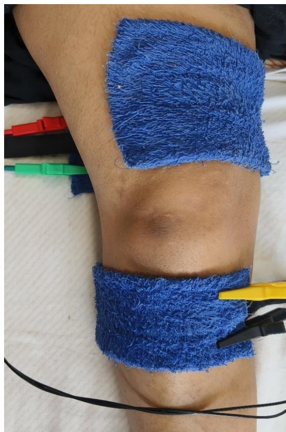
Figure 3. Electrode Placement using Alligator Clips

Alligator clips connect the FSM machine to the patient by clipping onto warm and wet towels, sandwiching the treatment area.