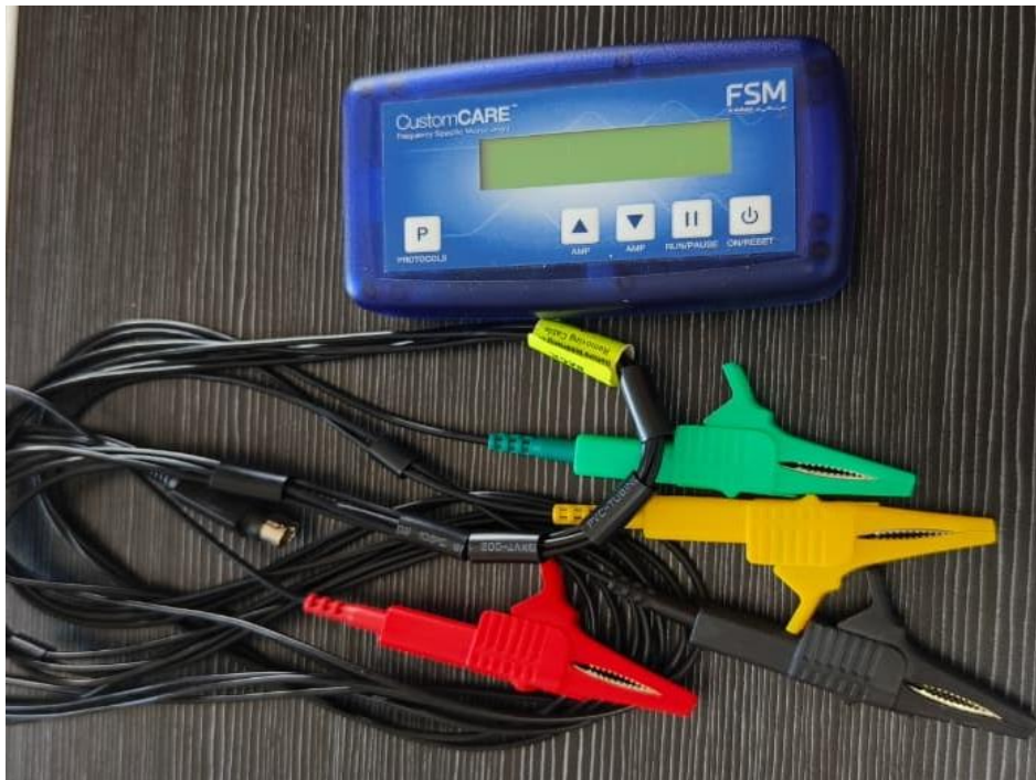
Figure 2. Custom Care FSM

Alligator clips connect the FSM machine to the patient by clipping onto warm and wet towels, sandwiching the treatment area.